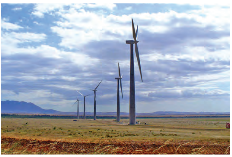
Aveng 135 MW wind power plant with 46 turbines.

"The most important thing about this nuclear focus is the potential it has to correct the economy. It is essential that the country has enough energy for investors to come and work on projects and not go elsewhere. In building these plants, work can continue on the Grand Inga project for hydro-electricity generation. That combination will give South Africa an excess of energy in the country that can be used to fuel industrialisation and infrastructure development, and allow us to export to the rest of the continent.