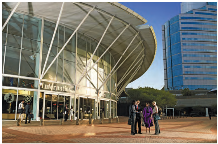
Durban International Convention Centre