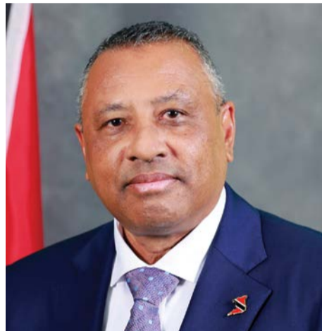
Kennedy Swaratsingh Minister of Planning, Economic Affairs and Development

dad and Tobago, a move expected to strengthen access to technical assistance, blended finance and private-sector support. Engagements with IDB Invest, the UK and Canada are also reshaping how housing and infrastructure projects are financed, moving away from heavy reliance on public guarantees toward private-led models and public-private partnerships.