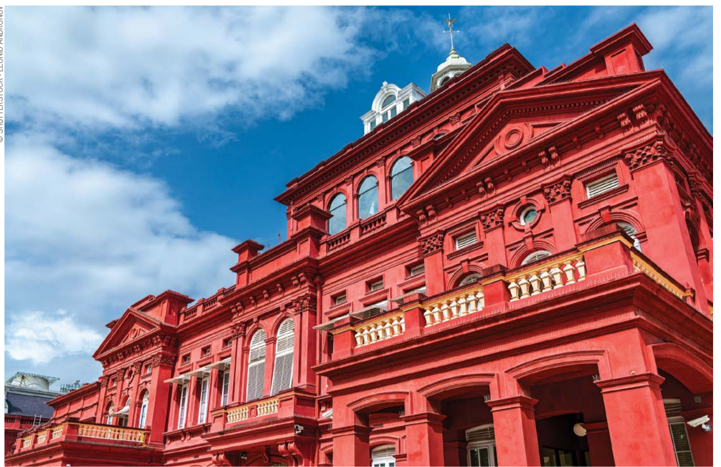
The Red House is the seat of Trinidad and Tobago's parliament. The current building dates back to 1907.

Collaboration is also deepening with international partners. Cabinet has approved the establishment of a World Bank office in Trini-