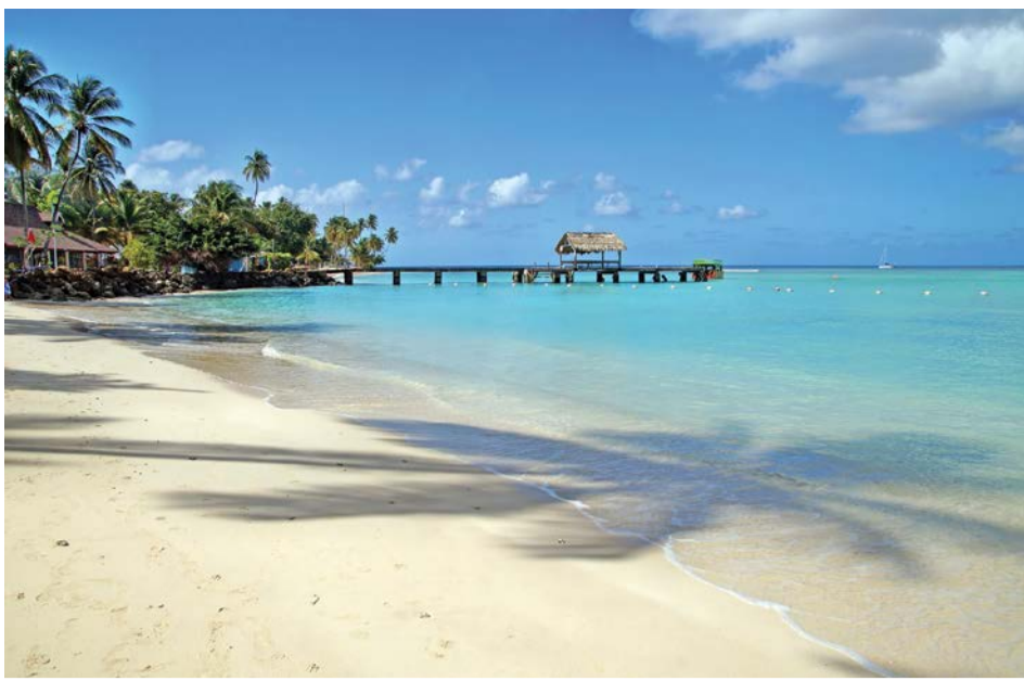
Pigeon Point in Tobago is one of the country's most famous beaches.