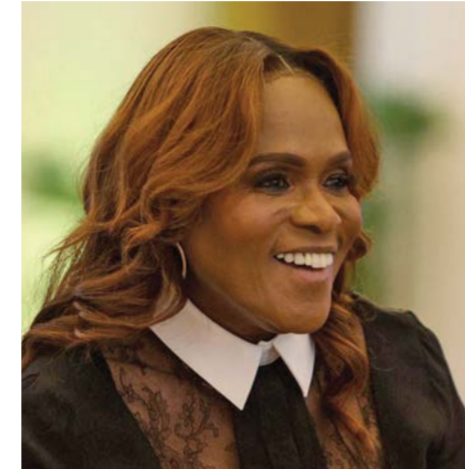
Jearlean John Minister of Works and Infrastructure

capabilities. Through initiatives such as Aero Park, improved passenger processing and new air service agreements with markets including Brazil, Colombia, Ghana and the Dominican Republic, the ministry is actively building on recent traffic growth. "The Ministry of Transport and Civil Aviation, through the Airports Authority of Trinidad and Tobago, continues to implement air service development initiatives to maintain current traffic and expand into new markets," Zakour affirms.