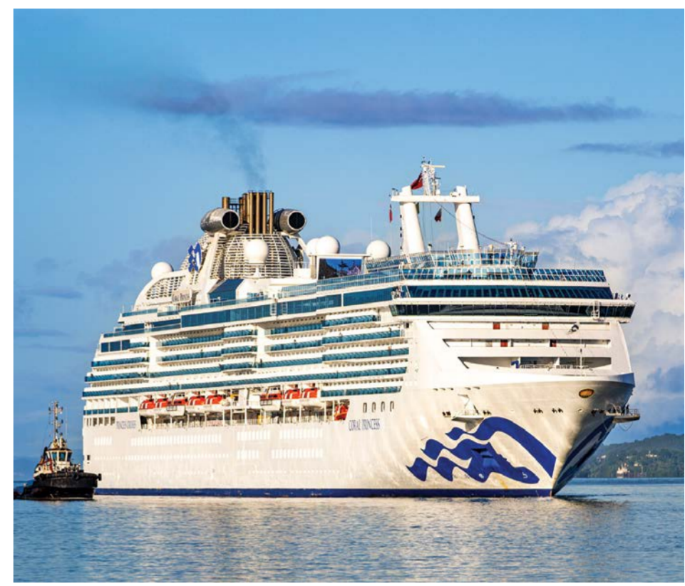
The Coral Princess visited Trinidad in December 2025 for the first time.

Vessel wait times have also declined sharply, from 78 hours to approximately 31.9 hours, now