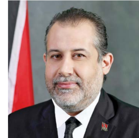
Eli Zakour Minister of Transport and Civil Aviation