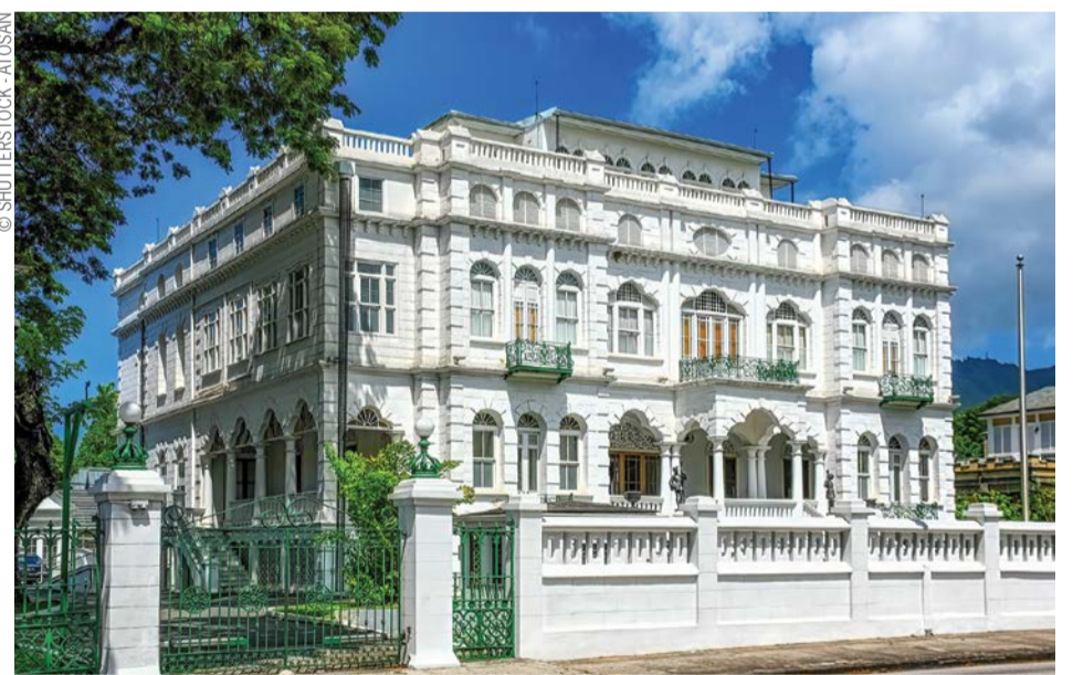
Whitehall serves as the office of the prime minister of Trinidad and Tobago.