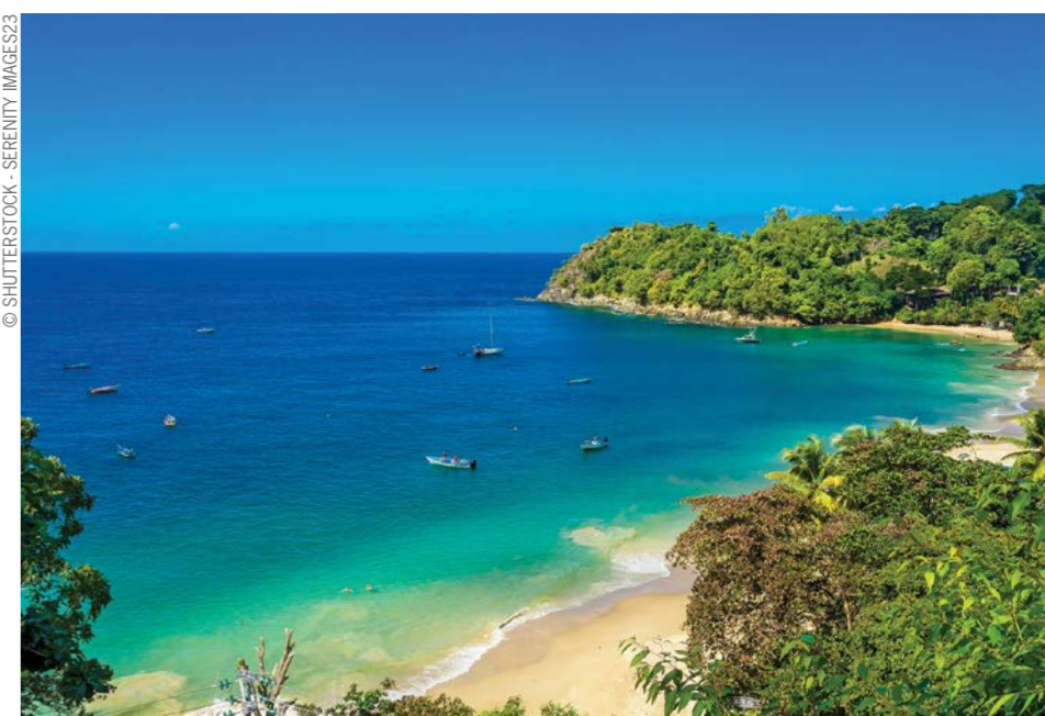
Castara is a small, traditional fishing village on Tobago's northern coast.