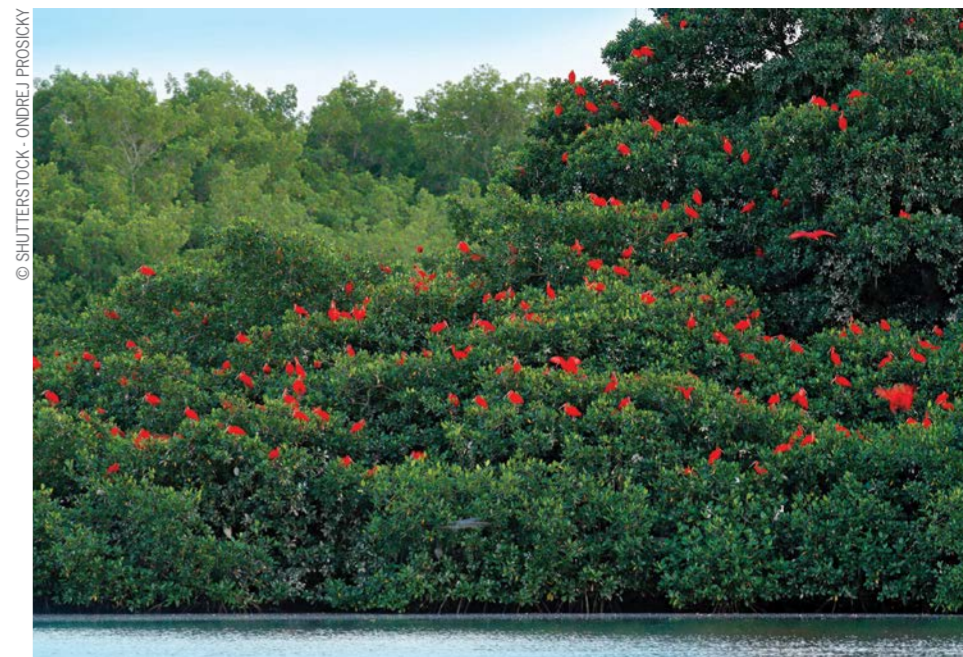
One of the country's national birds, the scarlett ibis, roosts in Caroni Bird Sanctuary.