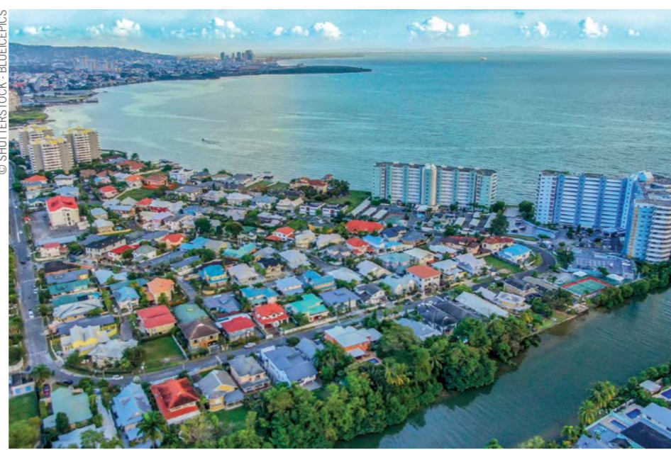
Westmoorings is an upscale neighborhood in Port of Spain with ocean views.

NIDCO is also a key implementer of the Sir Solomon Hochoy Highway extension to Point Fortin, part of a transformative network upgrade linking population and industrial centres in southern Trinidad. These highway works — advancing towards completion — are critical to reducing travel times, supporting industrial logistics and opening new corridors for economic activity. Complementing major highways, NIDCO's interchanges and arterial linkages have eased bottlenecks and bolstered traffic flow across high-demand routes, helping