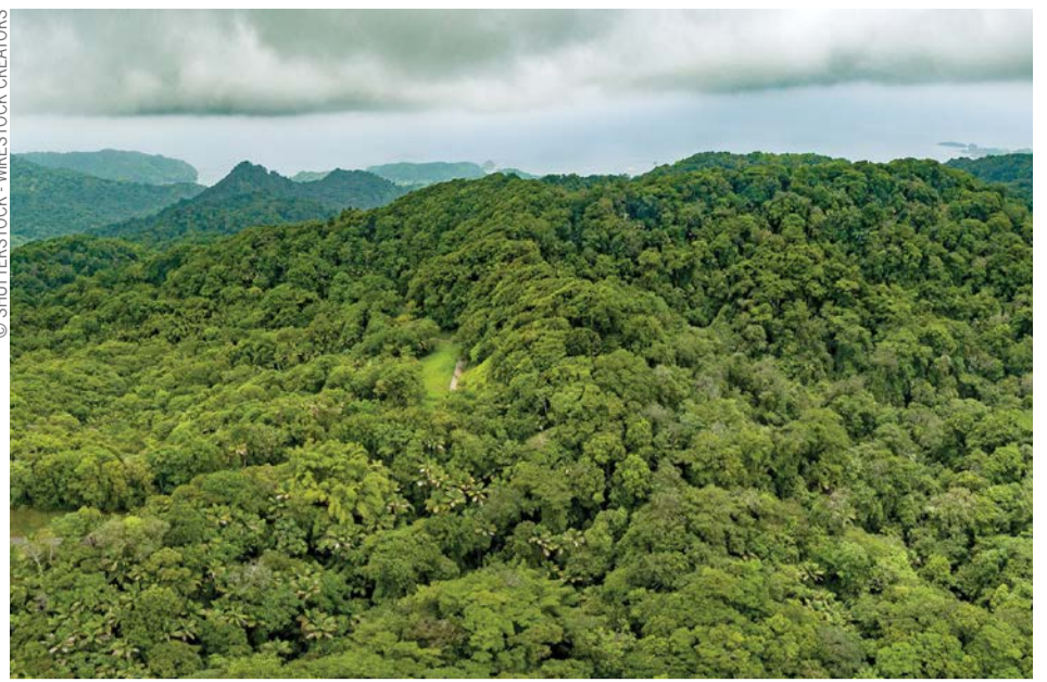
The Main Ridge Forest was the first protected forest in the Western Hemisphere.