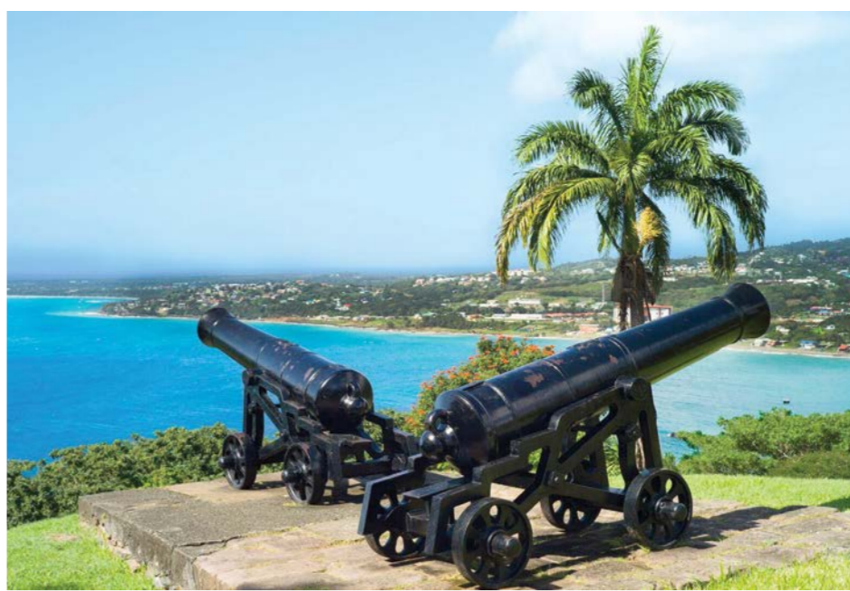
Fort King George built in 1781 overlooks Scarborough, Tobago's capital.

As the Caribbean energy landscape evolves, the government's message is one of pragmatism and confidence. With renewed upstream momentum, landmark projects like Manatee and TTUD-1 and a deliberate focus on governance and regional leadership, Trinidad and Tobago is positioning its energy sector not just for recovery — but for renewed relevance in a rapidly changing global energy order.