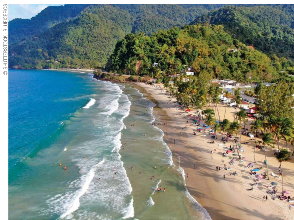
Maracas Beach is Trinidad's most famous beach and very popular at weekends.

At Piarco International Airport, the focus is on sustaining global service benchmarks while expanding commercial and operational