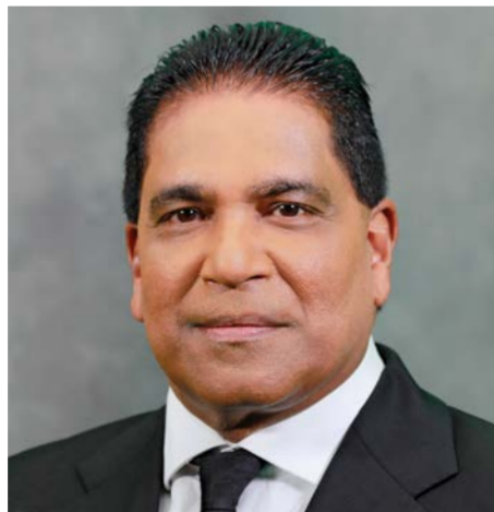
Roodal Moonilal Minister of Energy and Energy Industries

Under the leadership of Roodal Moonilal, Minister of Energy and Energy Industries, the government has outlined a clear and pragmatic strategy to stabilize output, restore competitiveness and reposition Trinidad and Tobago as the Caribbean's leading energy business hub.