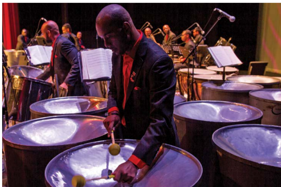
Laventille, a suburb of Port of Spain is the birthplace of the world-famous steelpan.

Together, NPICTT and First Citizens are modernizing Trinidad and Tobago's financial ecosystem and positioning the country as a regional leader in fintech innovation and digital payments — one that balances technological advancement with inclusivity, resilience and a distinctly human approach to banking.