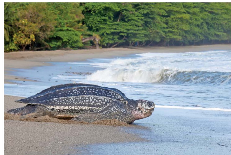
Both islands are very important sea turtle nesting sites between March and August.