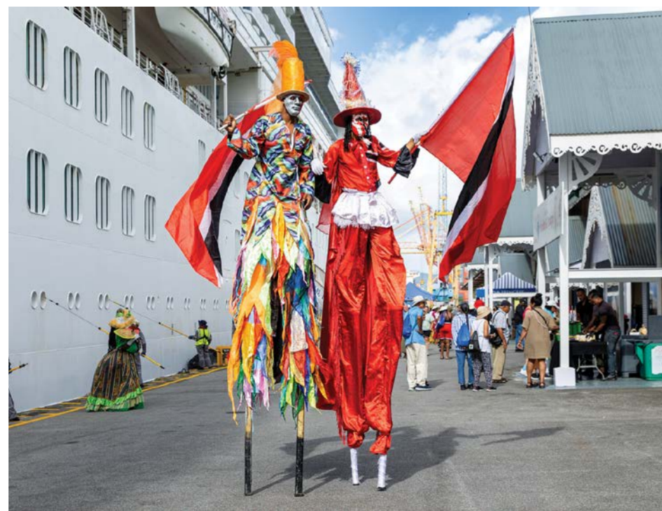
Moko Jumbies are some of the most famous characters of Trinidad's carnival.

Cargo and logistics form another increasingly important dimension of aviation growth. Piarco's dedicated cargo terminals already handle significant volumes, with major operators such as Amerijet, DHL, FedEx and UPS using Trinidad as a transshipment point for the Ca-