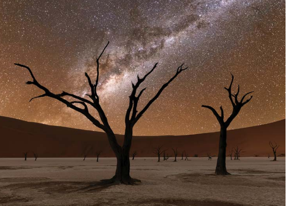
Namibia's sand dunes are the world's tallest and are famous for meeting ocean waters.