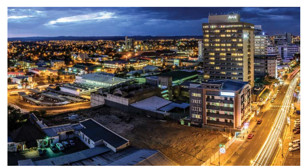
Namibia is determined to drive the global energy transition by becoming a hydrogen hub.

tional fossil fuels as well as renewables. We believe that exploiting and monetizing our fossil fuels can help us improve, or move faster on investing in renewables."