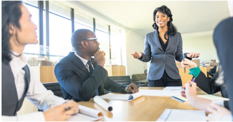
Shutterstock - El Nariz