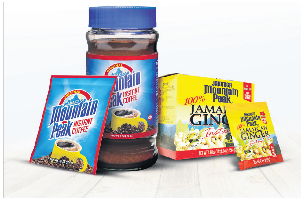
Salada Foods Jamaica Ltd.

The company provides guidance in trade-related