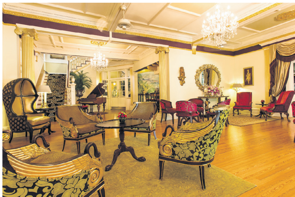
Terra Nova All-Suite Hotel.

The firm boasts five locations on the island, including vehicle rental operations at both international airports, and modern offices in key business hubs.